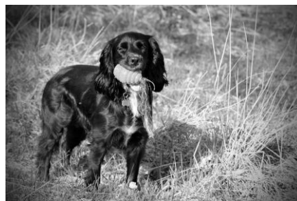
Wizzie out enjoying a walk carrying his favorite toy